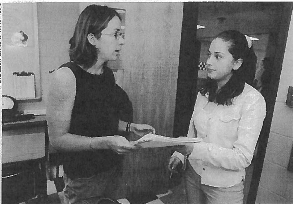
Grades should be a way of communicating with students about achievement and working to help students improve.